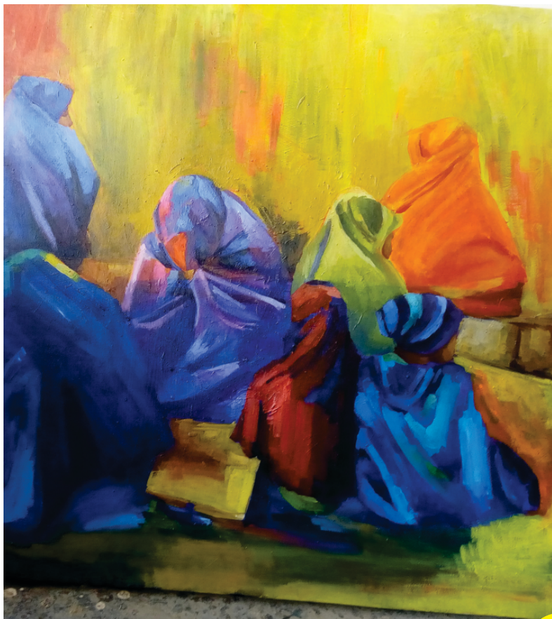
AMEH MATHIAS POOR EDUCATION 94 BY 100