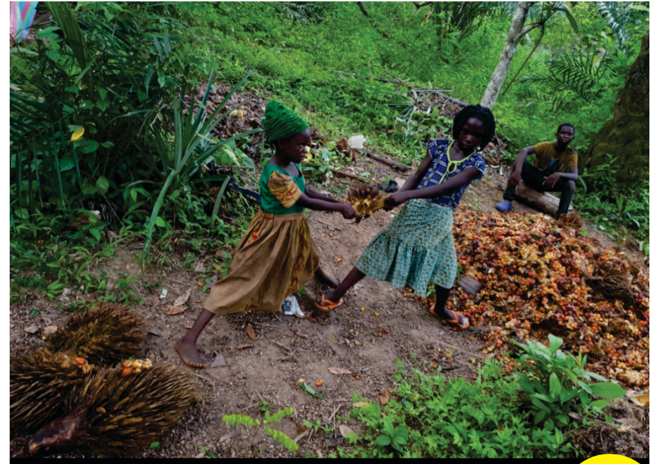
Oluokun Seun Samson The Struggle 60 by 30 Digital print Photography