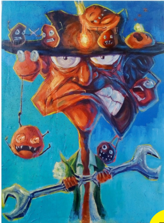
Yusuf Muktar Scrulooz, enough