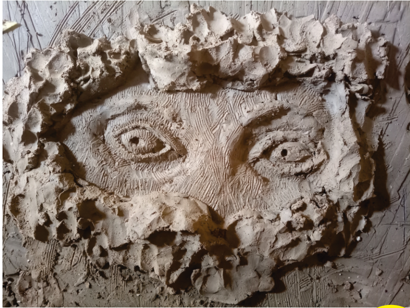
komolafe olawale elijah "behind the scene" 60cm by 40 cm