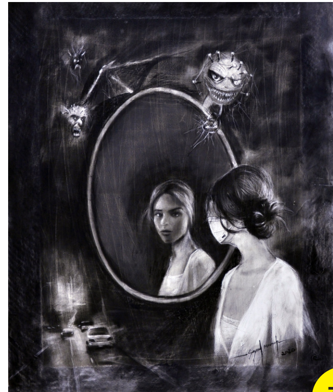
Sayeed Mommoh Hope in Dark Times Charcoal on textile 64x51cm